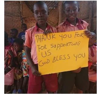
PSTP SWITA KENYA

So far this year, We have issued grants of $19,491.00 , nearly double the total grants of previous years, primarily for rice and food for elderly and orphans in Africa and The Philippines. This constitutes 2/3rds of our funds to-date, but we will not let the Elderly and Children down! Covet19 will not hinder our compassion and love for others as long as we can help!