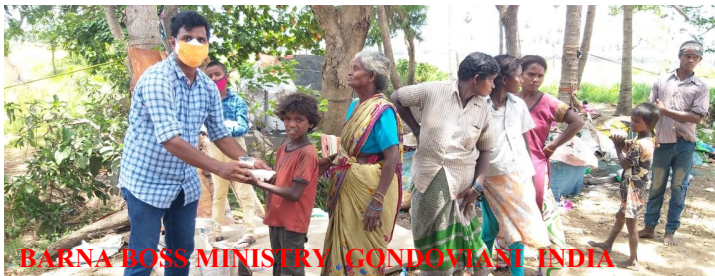
BARNA BOSS MINISTRY GONDOLIASI INDIA